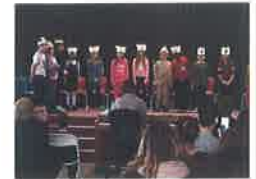
Bravo 2nd graders!